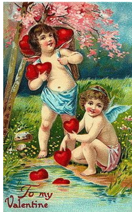
Victorian Valentine's Card

Modern Valentine's Day symbols include the heart-shaped outline, doves, and the figure of the winged Cupid . Since the 19th century, handwritten valentines have largely given way to mass-produced greeting cards , [4] and Valentine's Day has become the second-largest greeting card-sending holiday in the United States, behind only Christmas . [5]