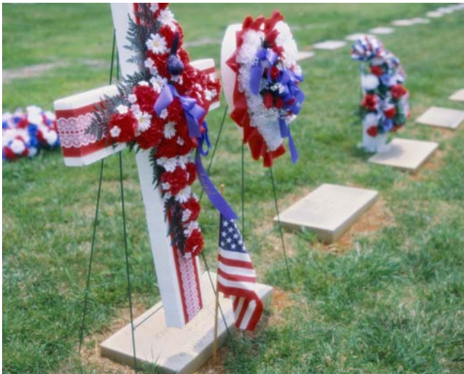
Remember Memorial Day - May 25, 2009