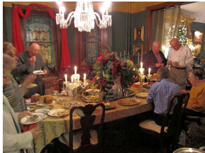
December unit meeting and party

Send your check payable to "Sokol Baltimore" to: Sokol Baltimore PO Box 448 White Marsh, MD 21128